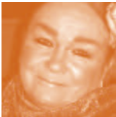
Patricia Polacco THURSDAY LUNCHEON SPEAKER